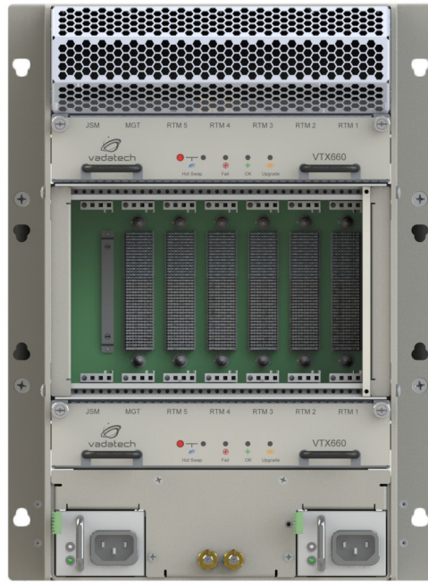
Figure 5: Chassis Layout - Rear