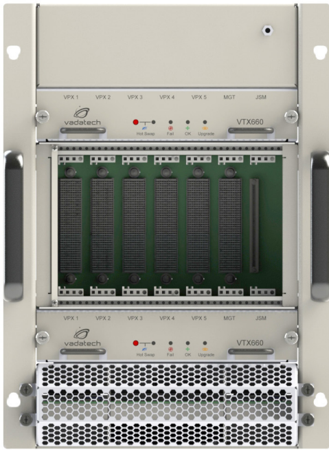
Figure 4: Chassis Layout - Front