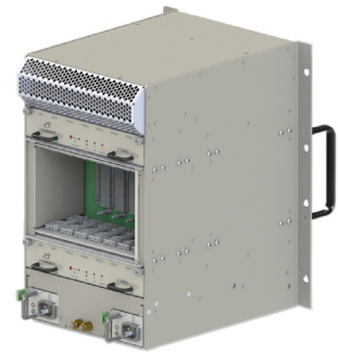
Figure 2: Rear View