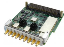
FMC227 12-bit 2.6 GSPS Dual ADC, Single DAC 14-bit 5.7 GSPS