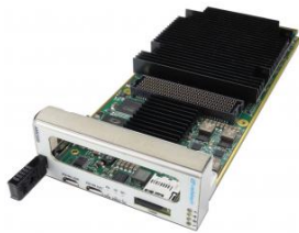
AMC595 Virtex UltraScale, FPGA Carrier