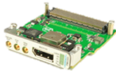
FMC223 14-bit 2.5 GSPS DAC