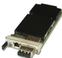
AMC530 Altera FPGA