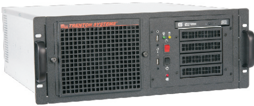
Trenton TVC4406 Video Controller Shown with an ATX motherboard