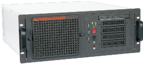
Trenton TVC4403 Video Controller Shown with a single processor SBC and backplane