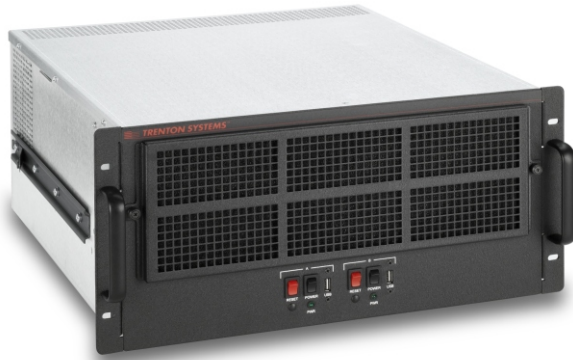
Trenton TRC5001 Rackmount System Shown with a two-segment backplane and two SBCs