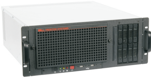
Trenton TRC4014 Rackmount System Shown with a 14-slot backplane and one SBC