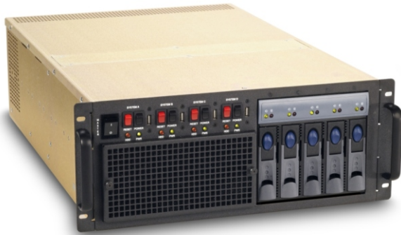
Trenton TRC4004 Rackmount System Shown with a four-segment backplane and four SBCs