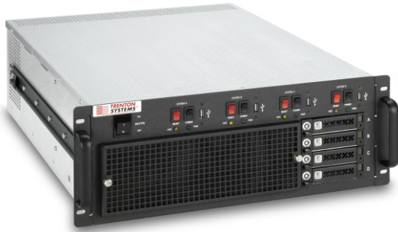
Trenton TRC4002 Rackmount System Shown with a four-segment backplane and four SBCs