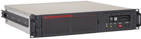
Trenton TRC2004 Rackmount System Shown with a dual-processor MicroATX motherboard