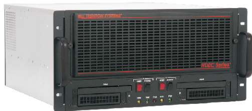
THS5090 HDEC Series Rackmount Computer Shown with two SFF backplanes and two SHBs

HDEC® Series 5U RACKMOUNT COMPUTER with LOCAL STORAGE and MEDIA