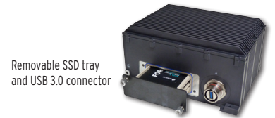
Removable SSD tray and USB 3.0 connector