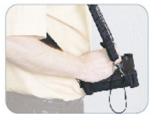
4-point Shoulder Strap