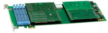
APCe8650 shown with four IP modules inserted.