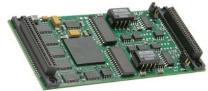
Acromag offers more than 40 IP modules to perform analog I/O, digital I/O, serial communication, CAN bus, Mil-Std-1553, and configurable FPGA functions.