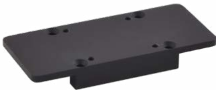
AP-CC-01 Conduction-Cool Kit

This Acropack card utilizes the latest AIM Common Hardware Core derived from the field proven MIL-STD-1553 interface to deliver low power consumption and high performance for rugged environments and embedded applications.