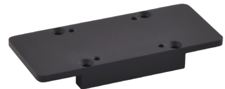
AP-CC-01 Conduction-Cool Kit

APSW-API-LNX Linux® support (website download only).