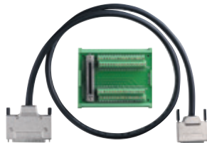
Termination Board DIN-68S-01 Mating Cable ACL-10568-1

Termination Board with a 68-pin SCSI-II Connector and DIN-Rail Mounting (Cables are not included. For information on mating cables, refer to Section 12.)