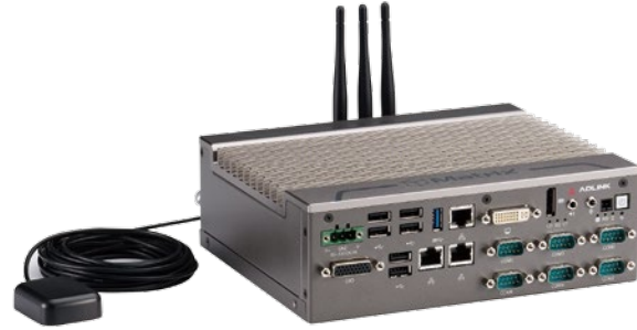
MXE-1400 with Antenna