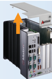
2. Withdraw the thumbscrew and remove the top cover