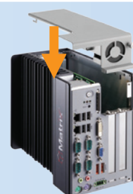
3. Replace it by plugging the hot-pluggable fan module cover into the fan connector on CPU board