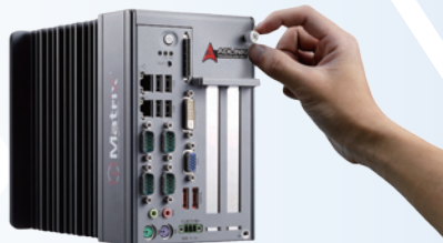
1. Undo the thumbscrew by hand