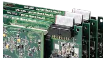
SSI bus cable for multiple card synchronization for DAQ/DAQe-2000 series