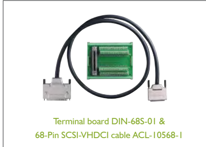
Terminal board DIN-68S-01 & 68-Pin SCSI-VHDCI cable ACL-10568-I