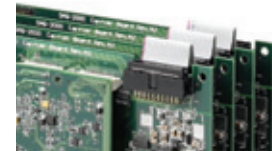
SSI bus cable for multiple cards synchronization

* Note: Analog output related pins on the DAQ/DAQe-2214